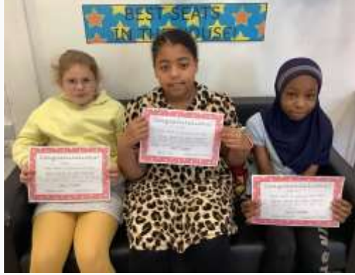
"Best Seats in the House"