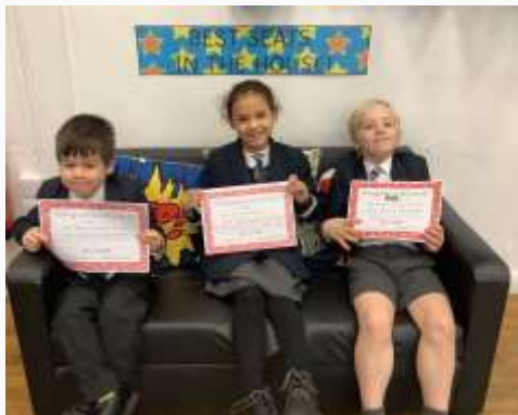
"Best Seats in the House"