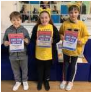
England Rocks individual & classwinners on Times Table Rock Stars