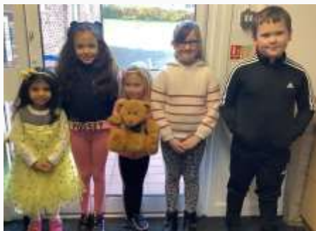
Punctuality: Swifts, Swallows, Doves, Toucans and Kingfishers