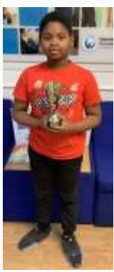
Tidiest classroom: Eagles