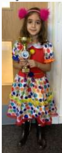
Tidiest classroom: Swifts