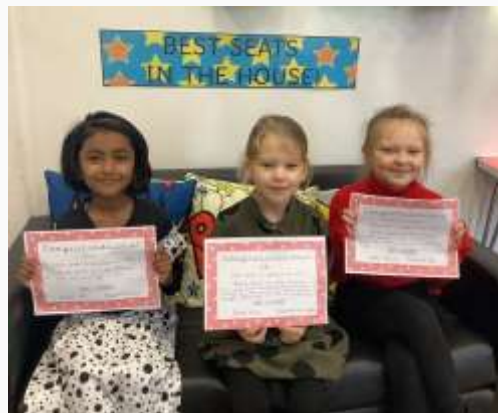
"Best Seats in the House"