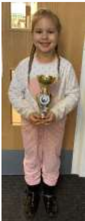
Most " Pudsiest Clothes: : Swifts