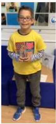
Most "Pudsiest clothes: Owls