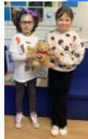
Punctuality: Red Kites & Parrots